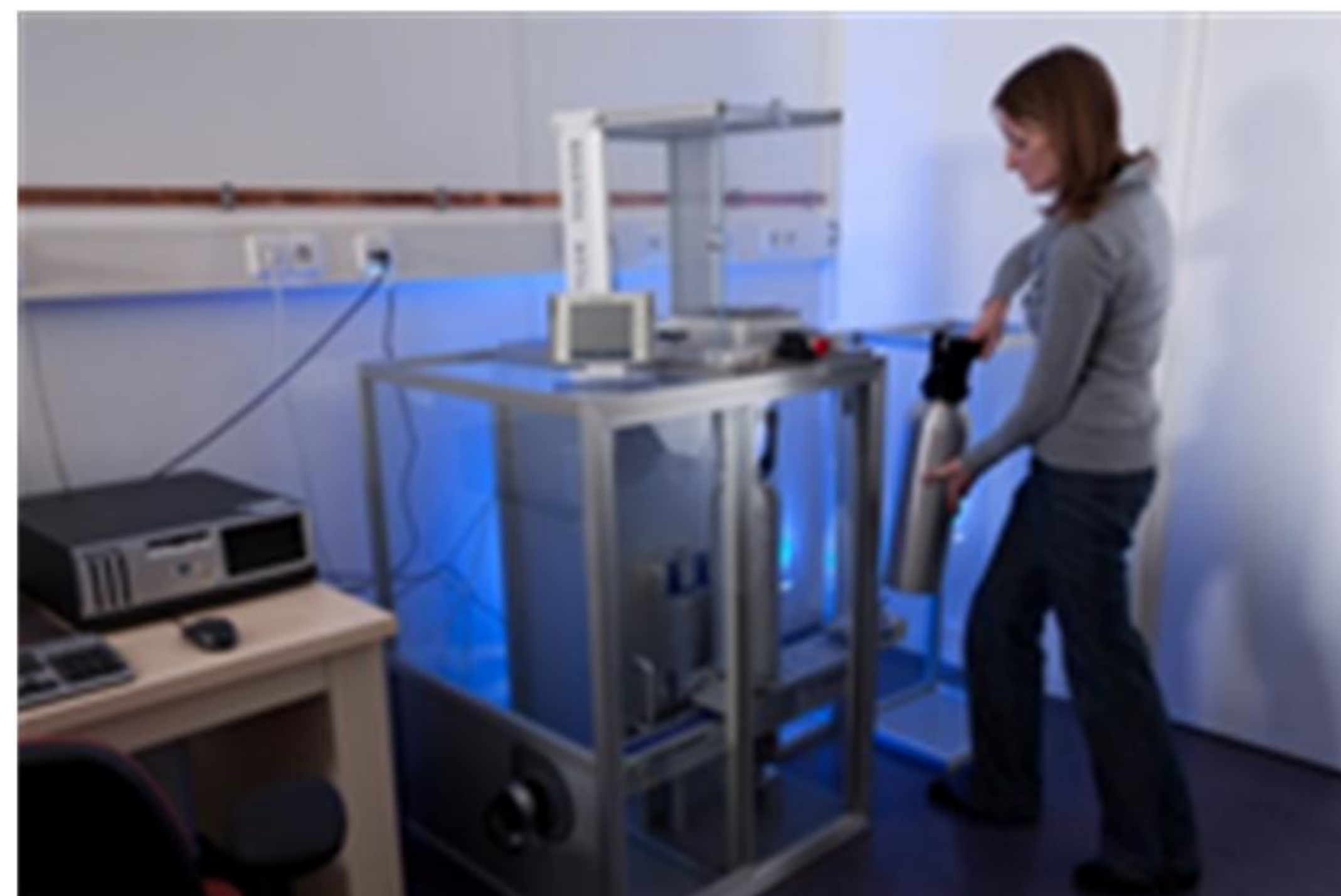
Automatic weighing device for gas cylinders

Within the EUMETRISPEC project SMU (Slovakia) and VSL (The Netherlands) are responsible for preparation of reference gas mixtures. These mixtures are provided to the other project partners and the Central Facility located at PTB. The gas mixtures are prepared in cylinders via gravimetric methods (ISO 6142) and validated by comparison with standard gas mixtures. Typical uncertainties in the amount of substance are in the range of 0.1-1%. Mixtures are being prepared for amongst others CO 2 , N 2 O, and CH 4 with synthetic air as matrix gas. The amount of substance levels prepared range from 300 nmol/mol up to the % level as different